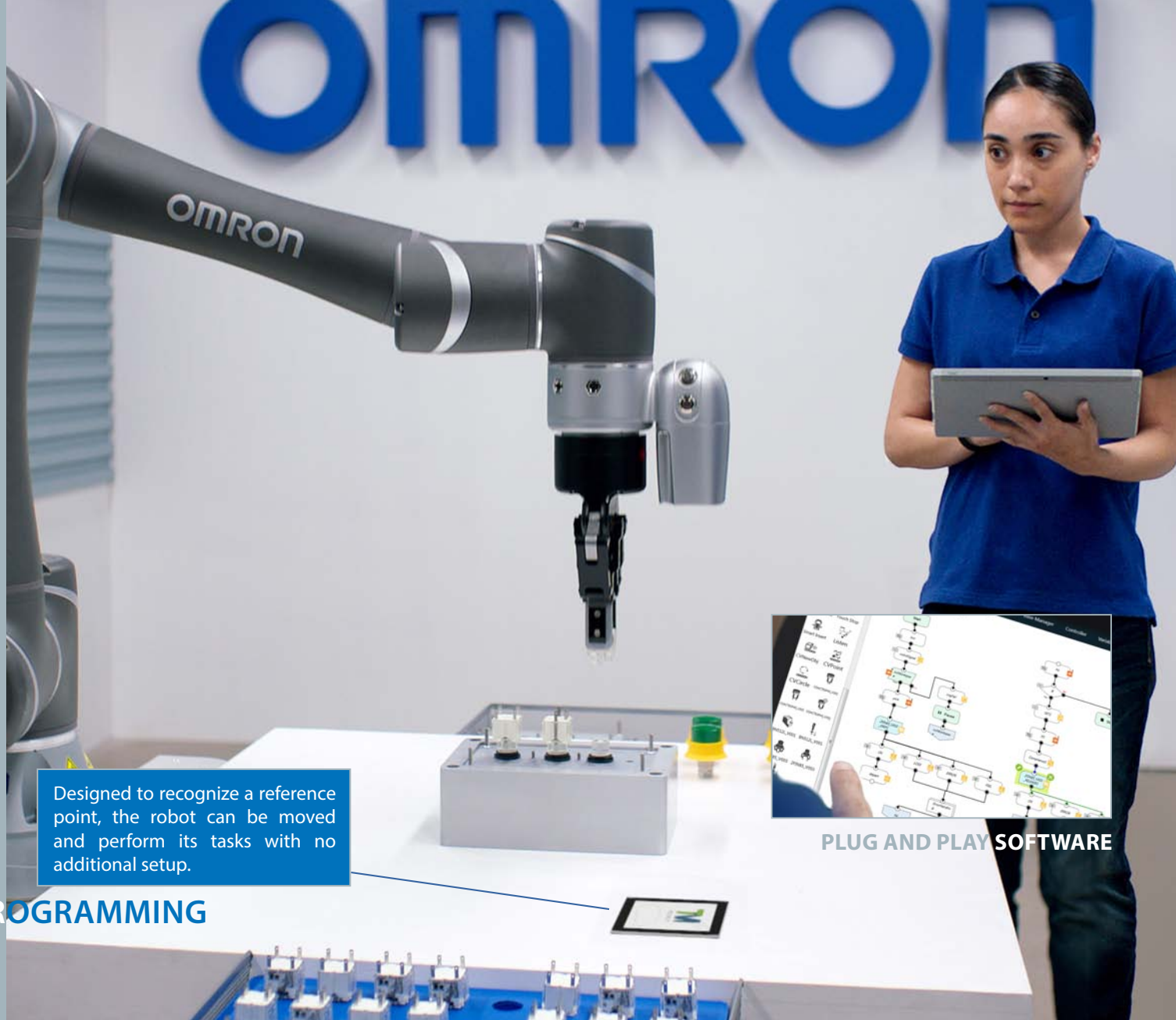
PLUG AND PLAY SOFTWARE